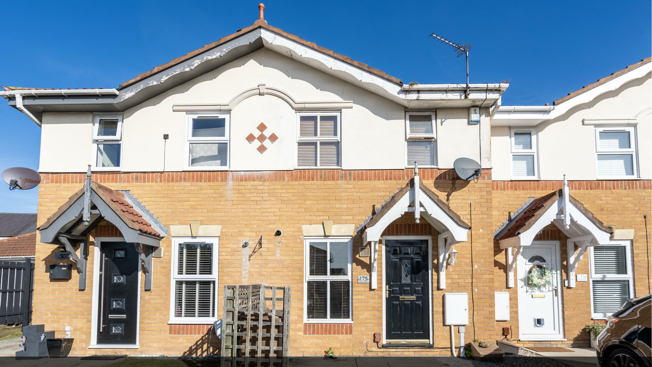
📍 Gardner Park, North Shields NE29 0EZ